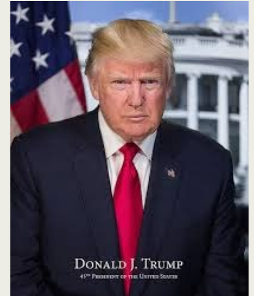
President Donald Trump