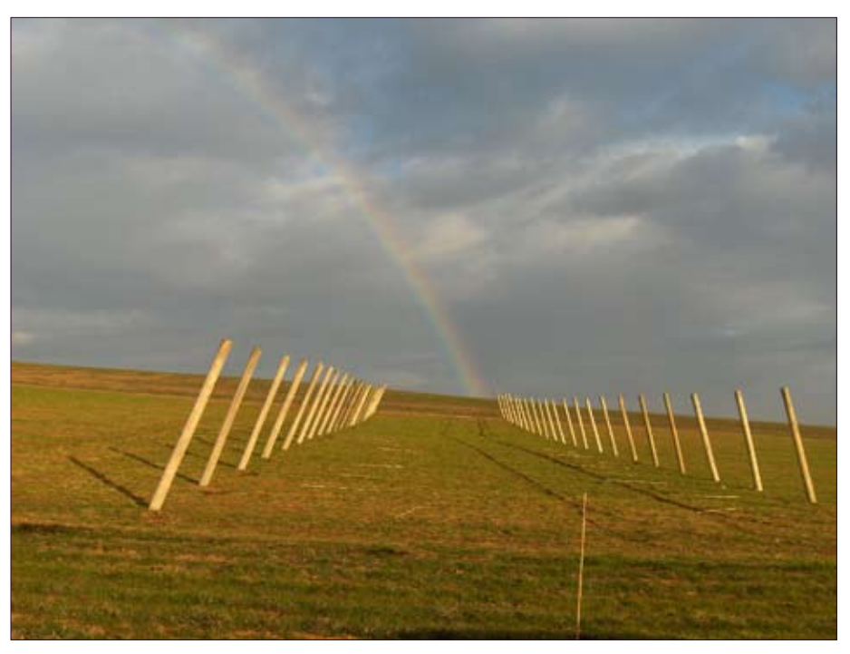
Planning before planting is the key to success!

http://egov.oregon.gov/ODA/PLANT/docs/pdf/quar_grape.pdf