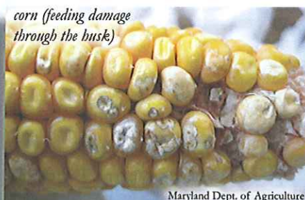
corn (feeding damage through the husk)