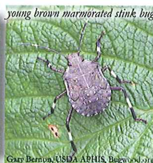
young brown marmorated stink bug