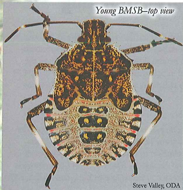
Young BMSB—top view