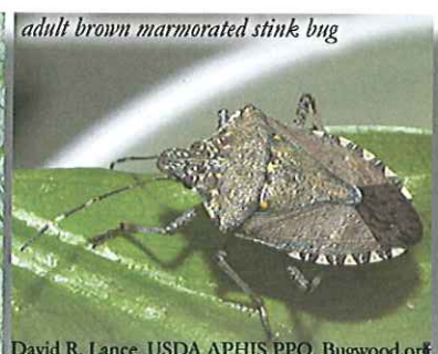
adult brown marmorated stink bug