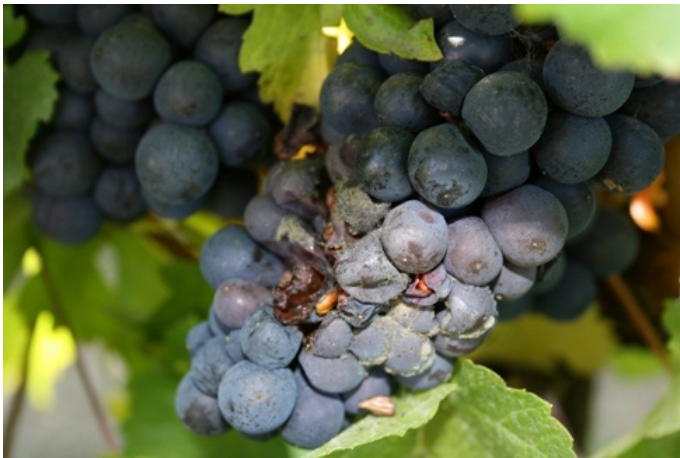
Botrytis infection in a near-ripe cluster.

Every time I write about fungicide resistance, people get upset as it is too chemically-focused. However, the first step in any chemical management is cultural management. Botrytis control in any crop system never starts with fungicides. Cultural control tactics are needed first, such as leaf removal and reducing canopy density. Once cultural tactics are in place, we can supplement with fungicides. Integrating several techniques is the only way to assure good management of Botrytis -caused diseases.