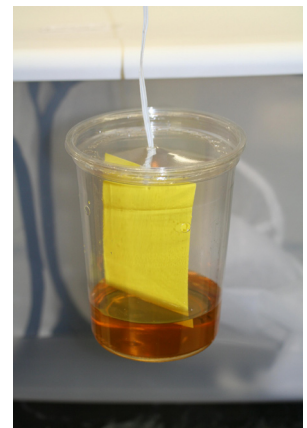
Holes drilled to allow SWD entry.

Place traps in a manner that targets high-risk areas such as other suitable crops close to grapes and place one trap every 1-4 acres in size during véraison. In order to help with early detection, place one trap in surrounding blackberries or other suitable SWD host-crop, one trap on the edge of the vineyard, and one trap 15-20 yards into the vineyard block.