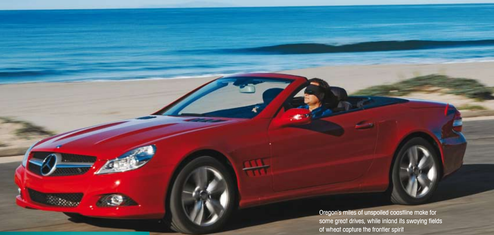
Oregon's miles of unspoiled coastline make for some great drives, while inland its swaying fields of wheat capture the frontier spirit